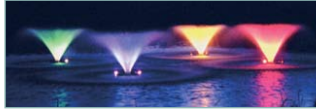
J-Series Fountains use three clear MR-16 bulbs (75-watt) or three colored bulbs (50-watt) in red, green, blue or yellow.

Kasco J-Series Fountains are available with an optional decorative 2- or 3-light kit to add beauty and interest to your aerated pond. The superior design of Kasco lighting sets a new quality standard that competitors attempt to achieve!