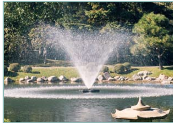
C Willow pattern