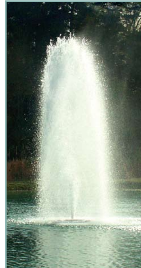
H Birch pattern