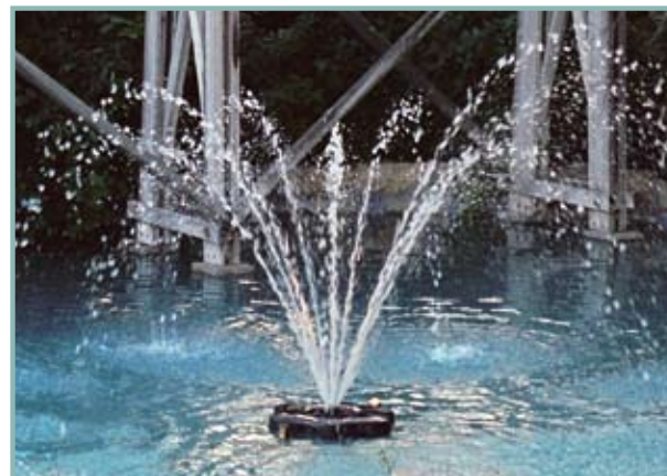
B Cypress pattern