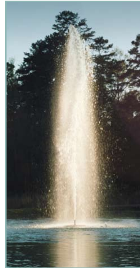
E Redwood pattern