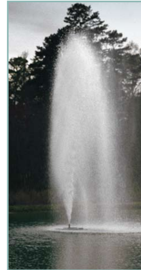
F Spruce pattern