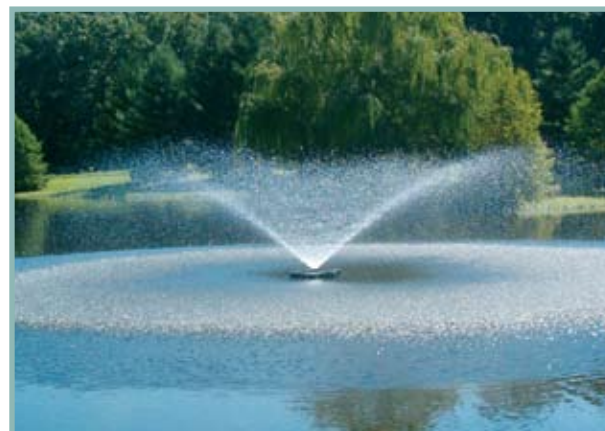
D Juniper pattern