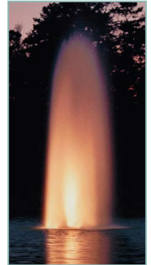
G Sequoia pattern with lighting