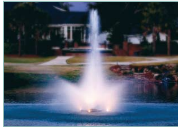
A Linden pattern with lighting